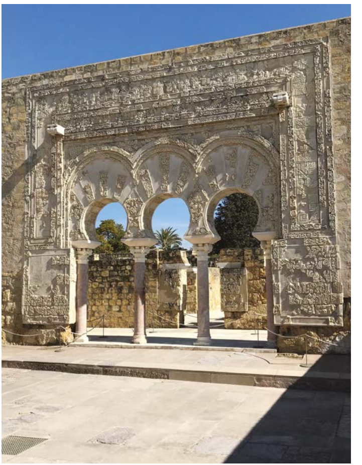
Medina Azahara Córdoba