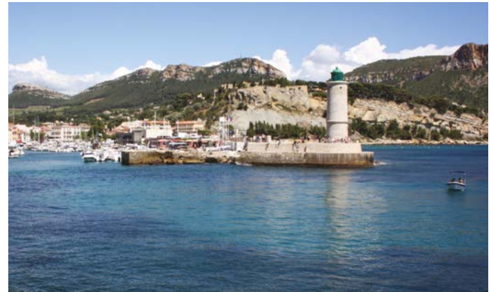
Student year abroad photograph of Port de Cassis, France