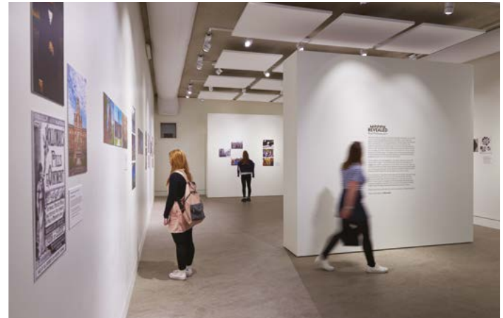
The Exhibition Space in the Emily Wilding Davison Building

If all the activity on campus is still not enough for you, then, of course, the many attractions and multicultural life of central London are close at hand whilst our proximity to Heathrow Airport and Waterloo and St Pancras stations makes trips to Europe, and beyond, extremely easy.