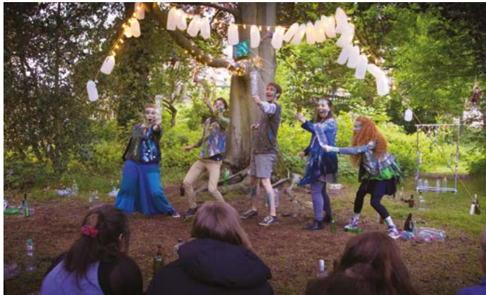
Drama performance on campus