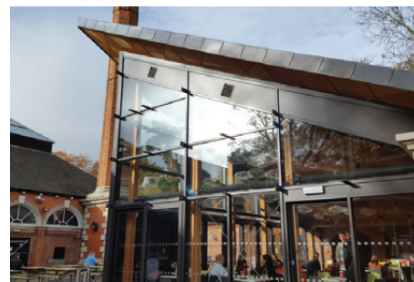
Map square A2

Cross the road using the zebra crossing to reach the Boilerhouse. The building is about five metres below the surrounding landscape which made it convenient for coal to be delivered directly to the coal store. There were originally three large boilers that supplied heat to the College through a series of pipes contained in an underground tunnel that is now closed off. The space has been fully refurbished to provide a lecture theatre, practice space and performance space. In 2016 the Boilerhouse Café, which sells a range of hot and cold food, was opened. In warmer months you can enjoy the atmosphere of the cobbled courtyard.