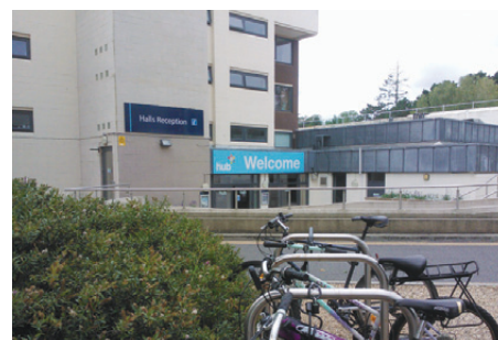
Map square B3

Exit The Hub and to the right you will find Medicine, the Student Unions' bar venue, which has pool tables and hosts regular events.