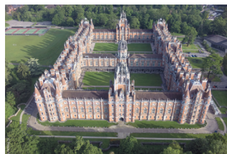
Map square B2

Enter the archway of the tower and ahead of you, you will find a statue of Queen Victoria. Founder's Dining room is directly behind the statue, up the stone steps, and is open at meal-times. (Step-free access to the Dining Hall is available inside when using the lift from the Visitors' Centre).