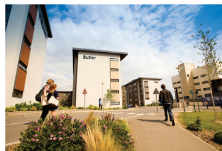
Map square B3