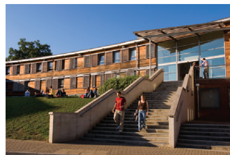
Map square A2

Return to the main road and continue walking down the hill. On your left is the International Building, which houses the office for the School of Humanities.