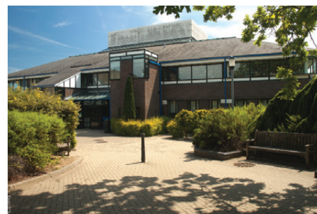
Map square B2

To continue your tour, retrace your steps back to the main road.