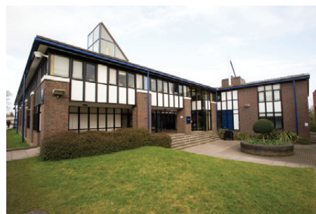
Map square B2

On the other side of the road you will see a number of academic buildings. The Arts Building houses two lecture theatres and a number of seminar rooms. In the McCrea Building you will find the school office for the School of Law and Social Sciences while the Horton Building contains learning, teaching and research space.