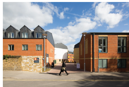
Map square B2

Retrace your steps back to Founder's using the footbridge or the Toucan crossing.