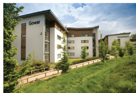
Map square C3

Follow the path to the right of the Hub until you reach Gowar and Wedderburn Halls. These halls, named after previous principals of the university, were built in 2005 and consist of flats for eight students, with en suite bedrooms.