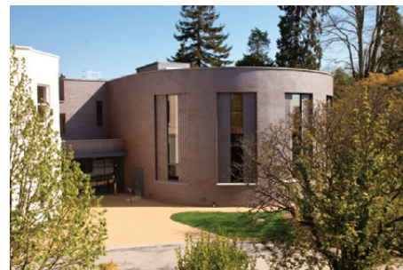
Map square A3

If you would like to visit our Department of Drama, continue following the road and cross the footbridge, or turn left out of the main gate and use the traffic islands to cross the road. The Caryl Churchill Theatre, named after the world-renowned playwright, was opened in 2013 and provides a flexible space for performance and practical study.