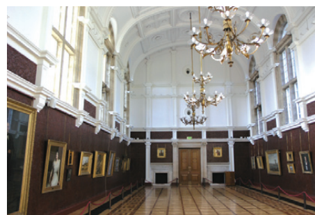
Map square B1

For more information on events at the Picture Gallery see royalholloway.ac.uk/events