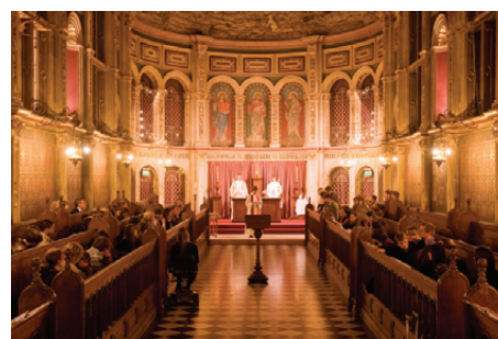
Map square B2

When you've finished viewing the Chapel, exit the quad at the Clock Tower and cross the road to the pathway.