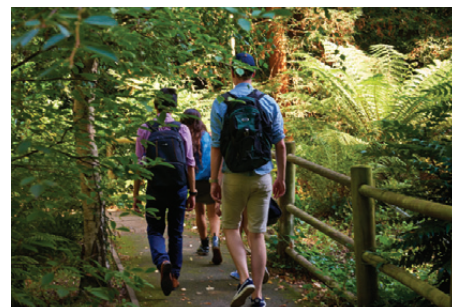
Map square C3

To return to the north of the campus to end your tour, follow the paths to the left of The Hub (facing towards the Shilling Building) to enter the woodland. You can follow the paths to explore the woodland and for a step-free route back, follow the signs towards the Emily Wilding Davison Building. Alternatively, you can follow the signs to Founder's, which will take you up stone steps.