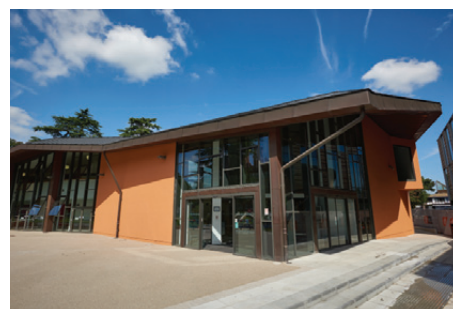
Map square B2