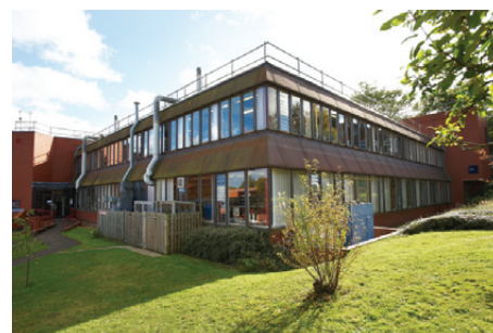
Map square A2