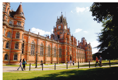
Map square B2

The building houses a Chapel, Picture Gallery, Dining Room and café/bar, along with a lecture theatre, Victorian reading rooms and our NHS health centre. Founder's is also a hall of residence, housing 500 of our students. Rooms were refurbished in 2014 but remain traditional in spirit. Each floor is single gender with students sharing bathrooms and pantries.