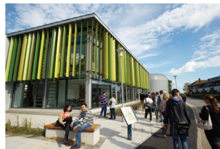
Map square B2