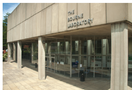
Map square B3