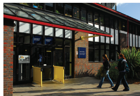
Map square B3

Leave the Students' Union and turn left to go down the steps or ramp back on to the main road. Turn right and you will see the Queen's Building on your left. This is where our Geography and Earth Sciences departments are based and was opened by Her Majesty The Queen in 1986. The Wolfson Building, which contains the office for the School of Life Sciences and the Environment, is opposite.