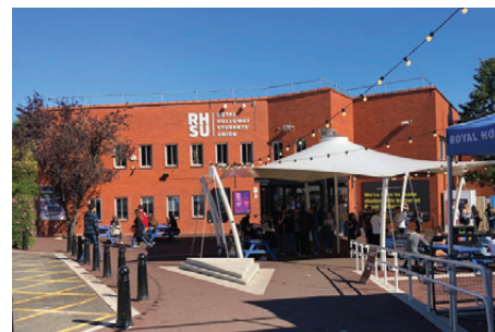
Map square A3

The Students' Union runs an independent advice centre as well as a range of clubs and societies, with more than 150 to get involved with on campus. For more information about what's on offer visit su.royalholloway.ac.uk