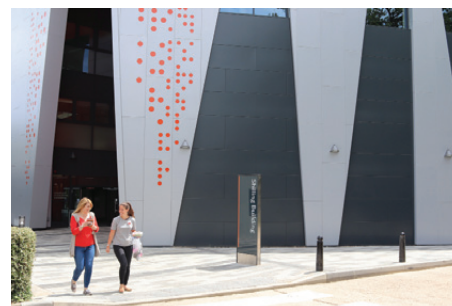
Map square B3

She raced motorbikes in the 1930s, and, after the war, raced cars. She raced regularly at Brooklands, in nearby Weybridge, where she won the Gold Star for lapping the circuit at 171 mph.